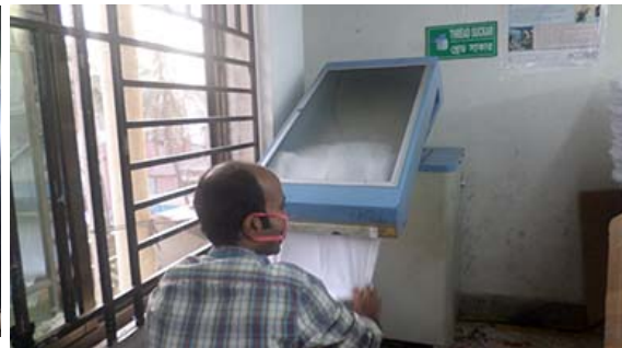
Thread Sucking Machine