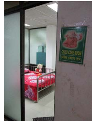
Child Care Room