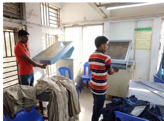
Thread Sucking Machine