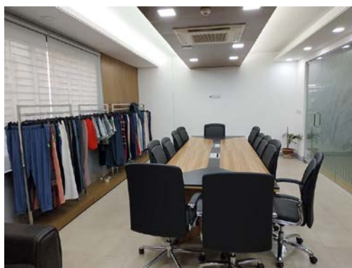
Board/ Meeting Room