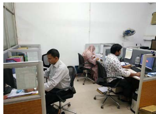
Admin & HR Room