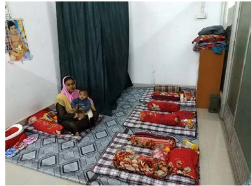
Child Care Room